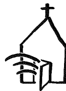
the welcome place.