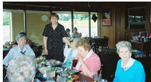
GLCW Spring Luncheon was held June 2nd at The Sands restaurant on Watson Road. Everyone ate, drank and was happy.