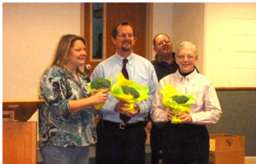
GO! Challenge Winners receiving their broccoli floral awards, representing the Health Cabinet, Council, and Choir Crescendos!