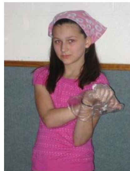
Thanks to our youth for helping out!