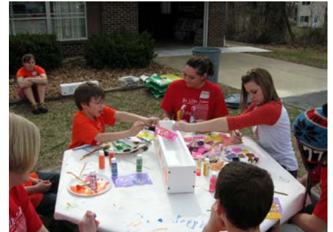
Decorating a planter box.>>