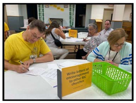
Wrote to other RIC churches in solidarity and encouragement