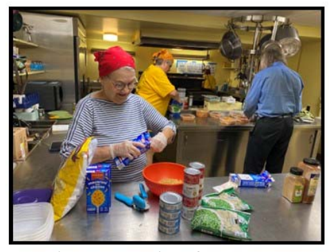
Made casseroles for our freezer