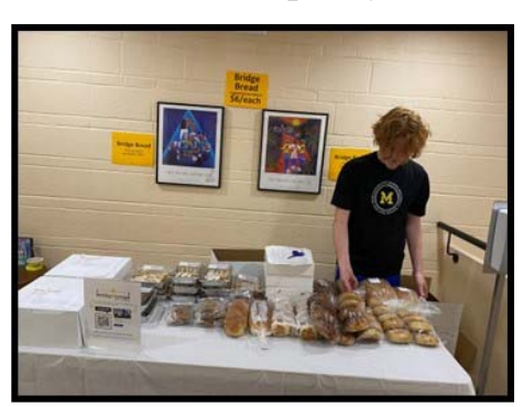
Helped the unhoused by buying Bridge Bread