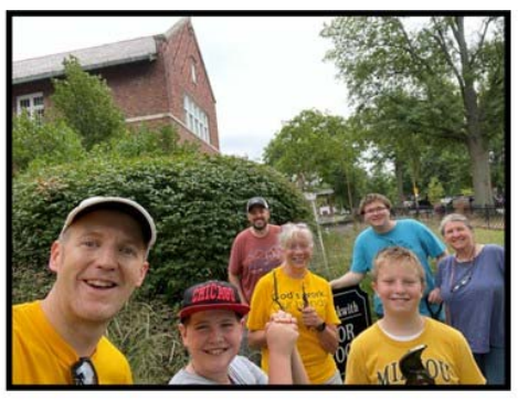
Helped Buder Elementary School with their garden