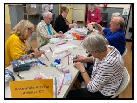
Assembled 90 service to go kits for LifeWiseSTL

Here's a breakdown of the impact you made: