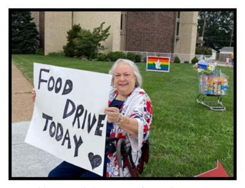
Collected items for the Little Free Pantry