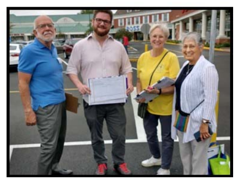
Collected signatures to help raise Missouri's minimum wage