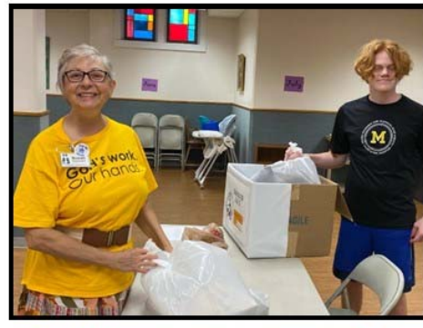
Collected items for CARE STL