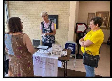
Gave out free gun locks through Lock It For Love